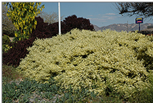
Moonlight Scotch Broom in bloom

Moonlight Scotch Broom is recommended for the following landscape applications;