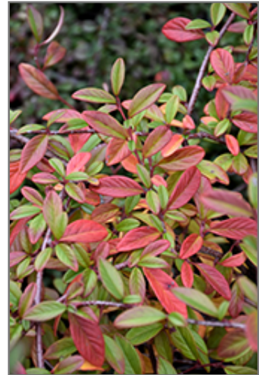
Scarlet Leader Willowleaf Cotoneaster in fall

This plant is not reliably hardy in our region, and certain restrictions may apply; contact the store for more information.