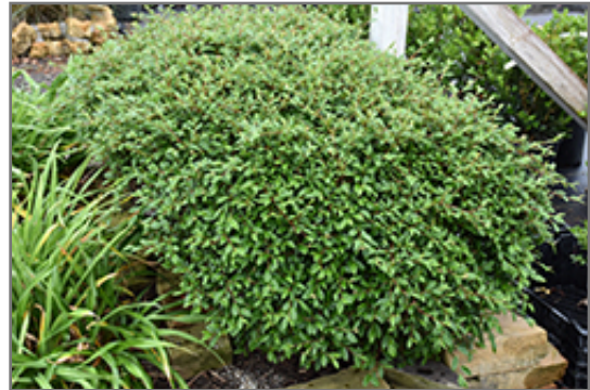
Scarlet Leader Willowleaf Cotoneaster