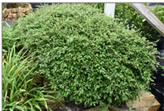
Scarlet Leader Willowleaf Cotoneaster