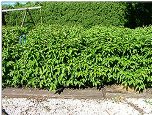
Huron Gray Dogwood

An underutilized and quite showy shrub for general garden or massing use; this is a dwarf, globular form; white flowers in spring, white berries in fall on showy pink stems, and good fall color; very adaptable, but suckers vigorously