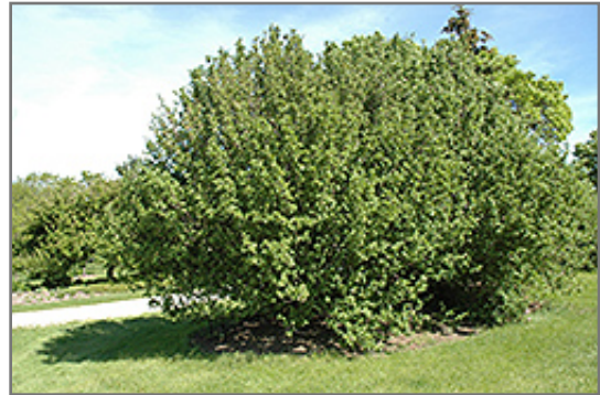
Upright Cornelian Cherry Dogwood