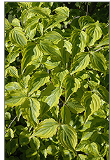
Limon Ripple Chinese Dogwood foliage