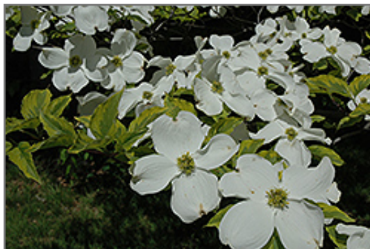
Rainbow Flowering Dogwood flowers