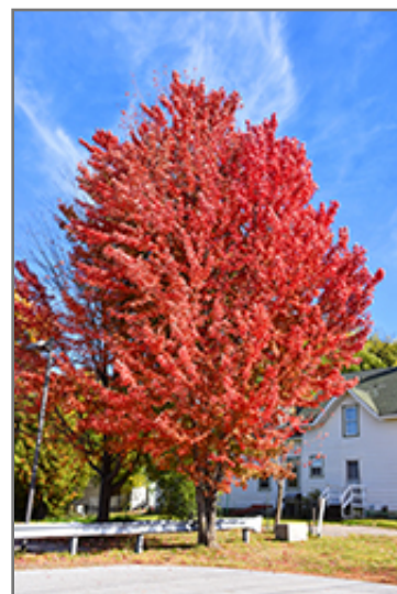
Celebration Maple in fall