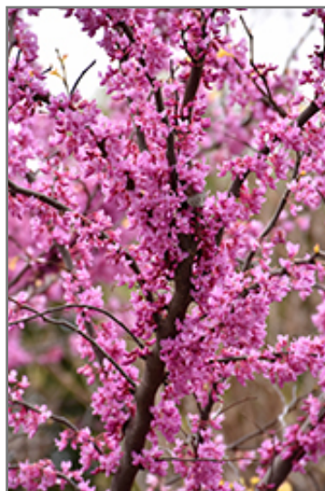
The Rising Sun Redbud flowers