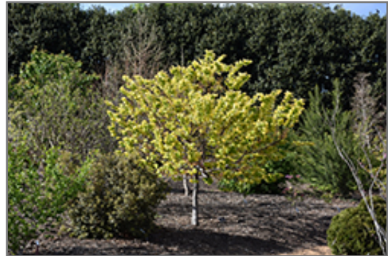
The Rising Sun Redbud in spring

This plant is not reliably hardy in our region, and certain restrictions may apply; contact the store for more information.