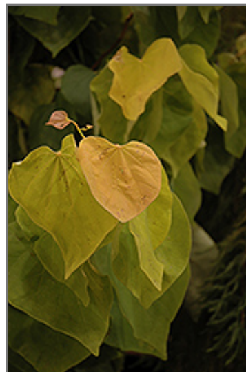
The Rising Sun Redbud foliage

The Rising Sun Redbud is recommended for the following landscape applications;