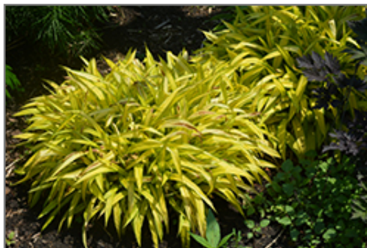
Banana Boat Broadleaf Sedge