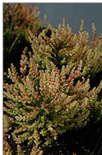
Spring Torch Heather foliage