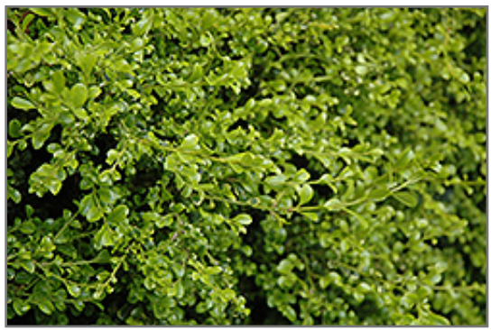
Curly Locks Boxwood foliage

This is a relatively low maintenance shrub, and can be pruned at anytime. It is a good choice for attracting bees to your yard, but is not particularly attractive to deer who tend to leave it alone in favor of tastier treats. It has no significant negative characteristics.