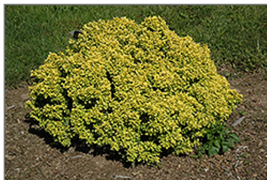
Golden Devine Dwarf Japanese Barberry