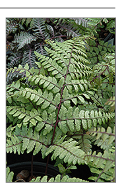
Eared Lady Fern foliage

Eared Lady Fern is primarily valued in the garden for its cascading habit of growth. Its attractive ferny bipinnately compound leaves emerge light green in spring, turning green in colour with pointy burgundy spines throughout the season.