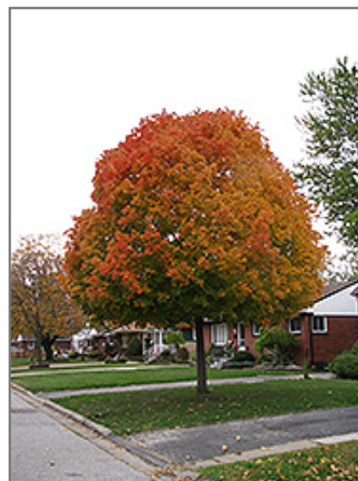
Autumn Radiance Red Maple in fall