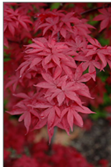
Twombly's Red Sentinel Japanese Maple foliage