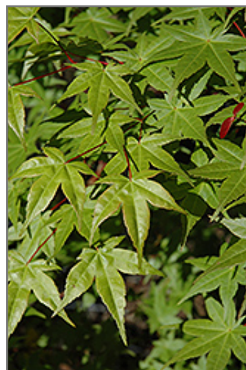
Shindeshojo Japanese Maple foliage