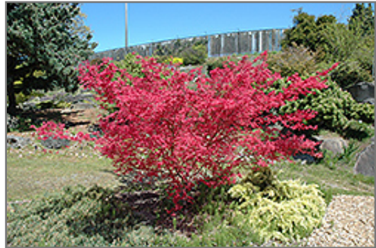
Shindeshojo Japanese Maple in spring

This plant is not reliably hardy in our region, and certain restrictions may apply; contact the store for more information.