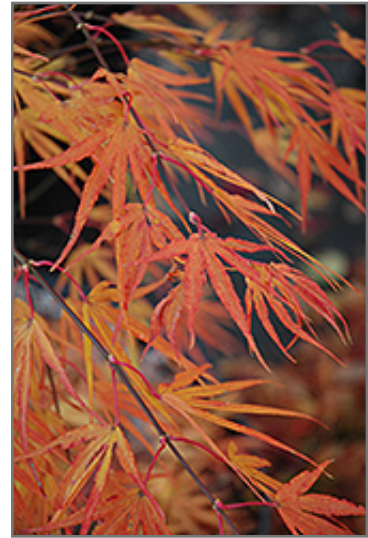
Scolopendrifolium Japanese Maple in fall

This plant is not reliably hardy in our region, and certain restrictions may apply; contact the store for more information.