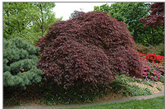
Red Select Cutleaf Japanese Maple