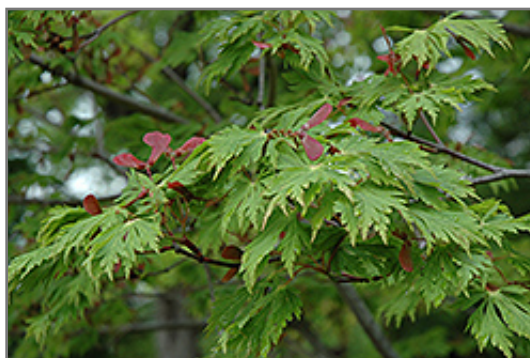
Maiku Jaku Fernleaf Full Moon Maple foliage