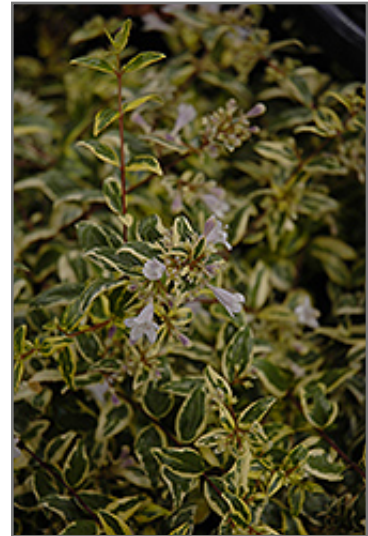
Twist of Lime Glossy Abelia flowers

This plant is not reliably hardy in our region, and certain restrictions may apply; contact the store for more information.