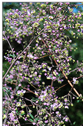
Rochebrun Meadow Rue flowers