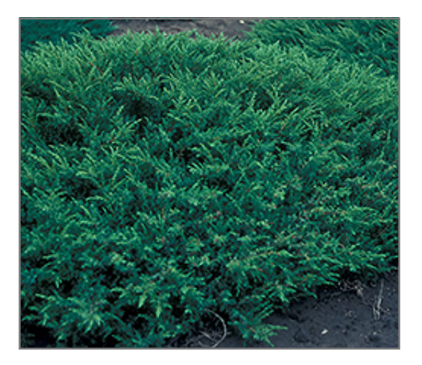
Copper Delight Juniper

Copper Delight Juniper is recommended for the following landscape applications;