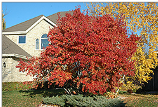
Red Rhapsody Amur Maple in fall

Red Rhapsody Amur Maple will grow to be about 20 feet tall at maturity, with a spread of 25 feet. It has a low canopy with a typical clearance of 4 feet from the ground, and is suitable for planting under power lines. It grows at a medium rate, and under ideal conditions can be expected to live for 60 years or more.