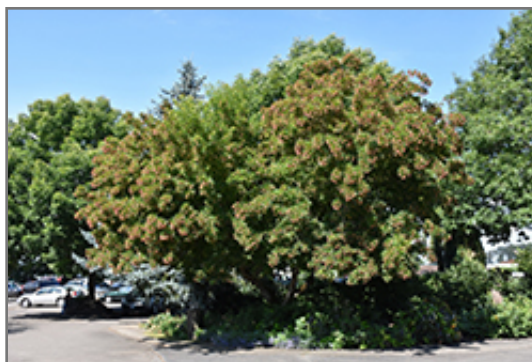
Red Rhapsody Amur Maple