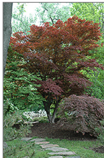
Oshio Beni Japanese Maple