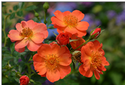
Oso Easy Paprika Rose flowers

Oso Easy Paprika Rose is recommended for the following landscape applications;