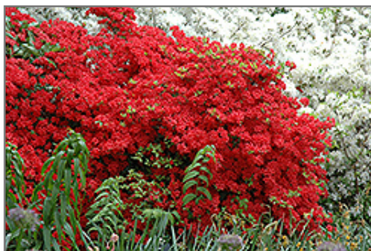
Stewartstonian Azalea in bloom