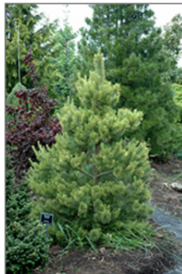
Gold Coin Scotch Pine

Gold Coin Scotch Pine is recommended for the following landscape applications;