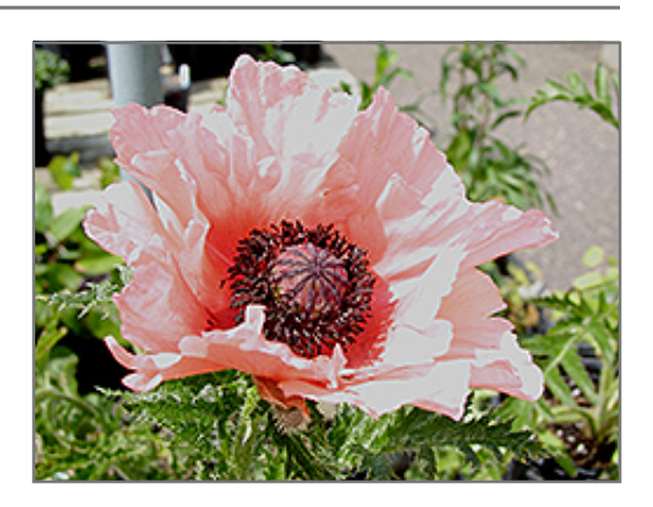
Clochard Poppy flowers