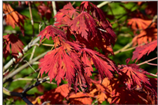
Cutleaf Fullmoon Maple in fall

This plant is not reliably hardy in our region, and certain restrictions may apply; contact the store for more information.