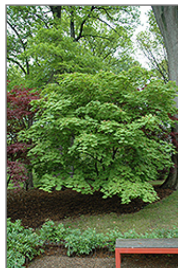
Cutleaf Fullmoon Maple