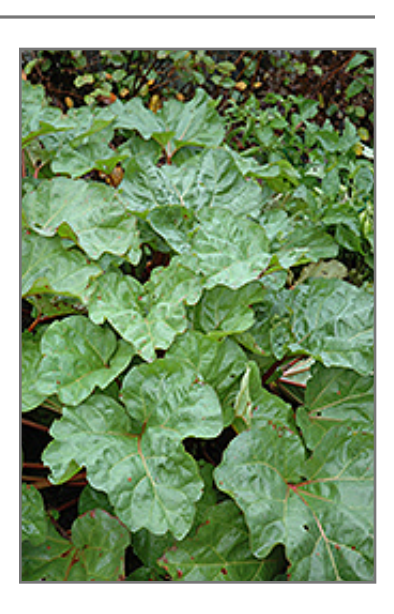
Valentine Rhubarb foliage

This is an herbaceous perennial with a rigidly upright and towering form. Its wonderfully bold, coarse texture can be very effective in a balanced garden composition. This plant will require occasional maintenance and upkeep, and can be pruned at anytime. Deer don't particularly care for this plant and will usually leave it alone in favor of tastier treats. It has no significant negative characteristics.