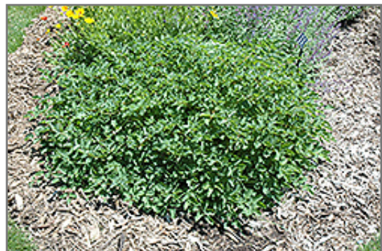
Japanese Bottlebrush