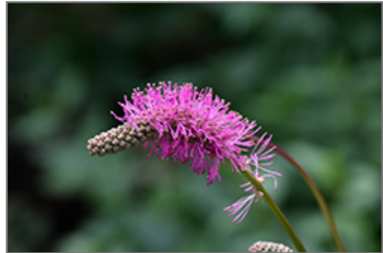
Japanese Bottlebrush flowers