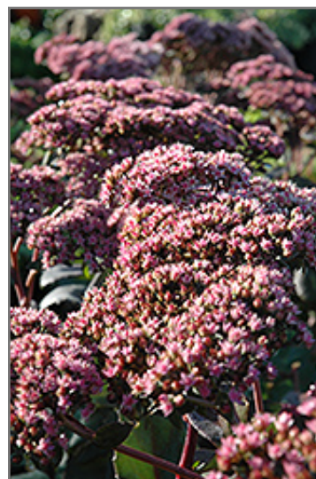
Maestro Stonecrop flowers

Maestro Stonecrop is recommended for the following landscape applications;