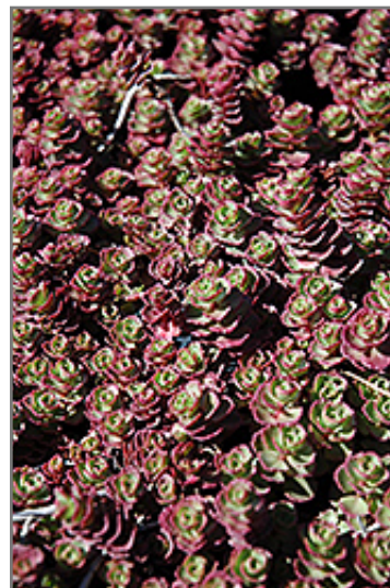
Red Carpet Stonecrop foliage