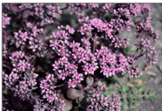
Red Carpet Stonecrop flowers