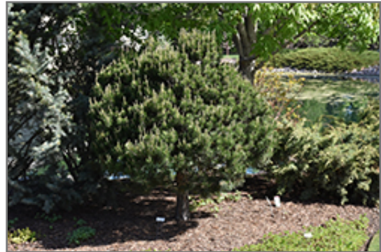
Dwarf Scotch Pine