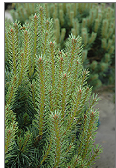
Dwarf Scotch Pine foliage