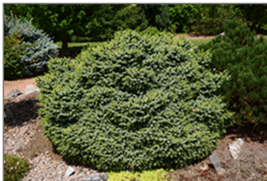
Gunther Dwarf Spruce

Gunther Dwarf Spruce will grow to be about 24 inches tall at maturity, with a spread of 3 feet. It tends to fill out right to the ground and therefore doesn't necessarily require facer plants in front. It grows at a slow rate, and under ideal conditions can be expected to live for 60 years or more.