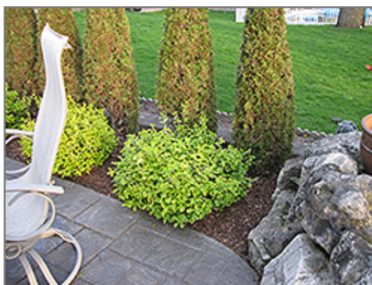
Country Gold Wintercreeper