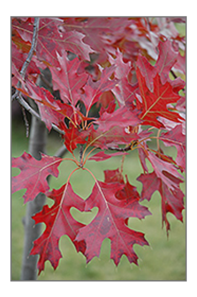
Northern Pin Oak in fall