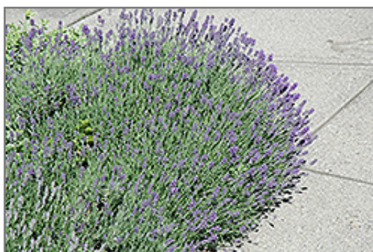
Munstead Lavender in bloom