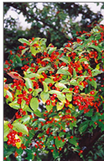
Oriental Photinia fruit