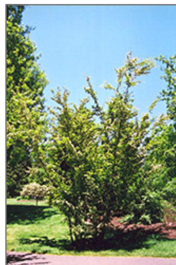
Oriental Photinia in bloom