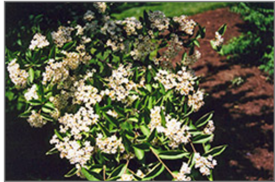
Oriental Photinia flowers

This plant is not reliably hardy in our region, and certain restrictions may apply; contact the store for more information.