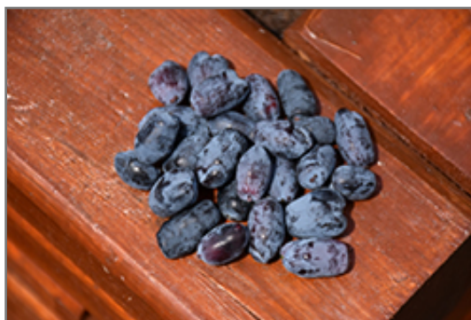
Berry Smart Belle Honeyberry fruit

Berry Smart Belle Honeyberry features subtle creamy white flowers along the branches in early spring. It has green deciduous foliage. The narrow leaves do not develop any appreciable fall colour. It features an abundance of magnificent navy blue berries with powder blue overtones in late spring.