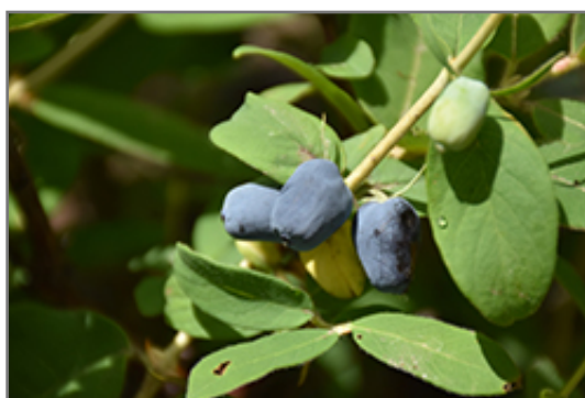
Berry Smart Belle Honeyberry fruit