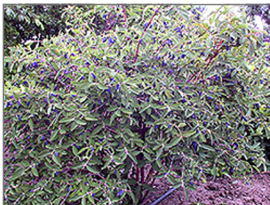
Berry Smart Belle Honeyberry

This shrub is quite ornamental as well as edible, and is as much at home in a landscape or flower garden as it is in a designated edibles garden. It does best in full sun to partial shade. It prefers dry to average moisture levels with very well-drained soil, and will often die in standing water. It is not particular as to soil type or pH. It is highly tolerant of urban pollution and will even thrive in inner city environments. This is a selected variety of a species not originally from North America.