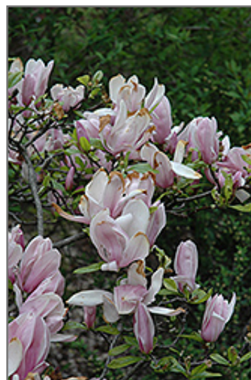
George Henry Kern Magnolia flowers