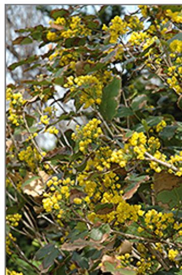
New Market Oregon Grape flowers

New Market Oregon Grape is recommended for the following landscape applications;