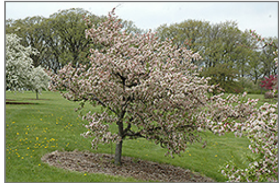
Leprechaun Flowering Crab in bloom