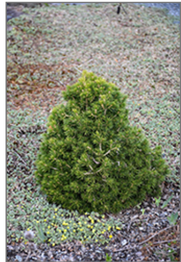
Tompa Dwarf Spruce