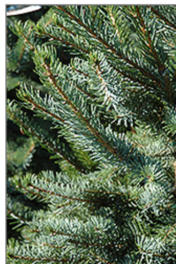
Bruns Spruce foliage