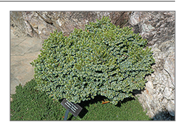
Pimoko Spruce