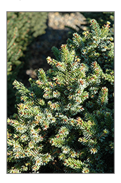
Pimoko Spruce foliage