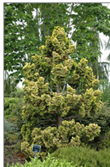
Dwarf Golden Hinoki Falsecypress