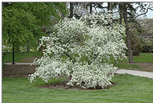
Fauriei Pear in bloom

Fauriei Pear will grow to be about 25 feet tall at maturity, with a spread of 20 feet. It has a low canopy with a typical clearance of 3 feet from the ground, and is suitable for planting under power lines. It grows at a medium rate, and under ideal conditions can be expected to live for 50 years or more.