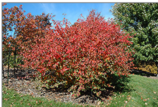
Korean Sun Pear in fall

Korean Sun Pear will grow to be about 15 feet tall at maturity, with a spread of 20 feet. It has a low canopy with a typical clearance of 2 feet from the ground, and is suitable for planting under power lines. It grows at a medium rate, and under ideal conditions can be expected to live for 50 years or more.