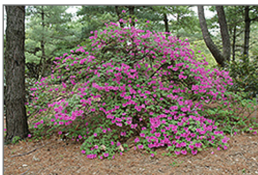
Marjorie Azalea in bloom